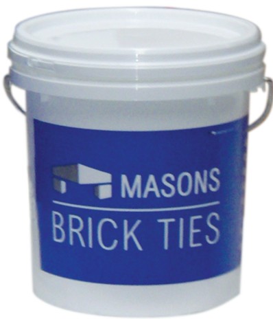
SCREW TIE - LONG (110MM)